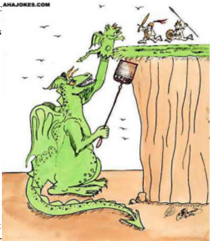
How a dragon gets his dinner.

The woman in front of us, pointing to the sign, remarked, "Believe me, if I HAD a bill larger than $20, I wouldn't be eating here."