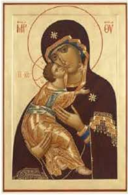
Theotokos of Vladimir