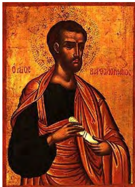
Apostle Bartholomew of the Twelve

Thursday, June 9 Afterfeast of Ascension St. Cyril, Archbishop of Alexandria (444)